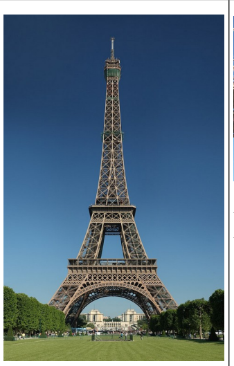
Figure 1: Gustave Eiffel, The Eiffel Tower, 1889, Steel with iron coating, 324 m x 125 m x 125 m