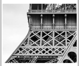
Figure 3: Close-up on the names of the The Eiffel Tower