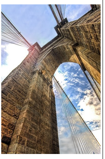
Figure 4: Towers of the Present Day Brooklyn Bridge, 2008